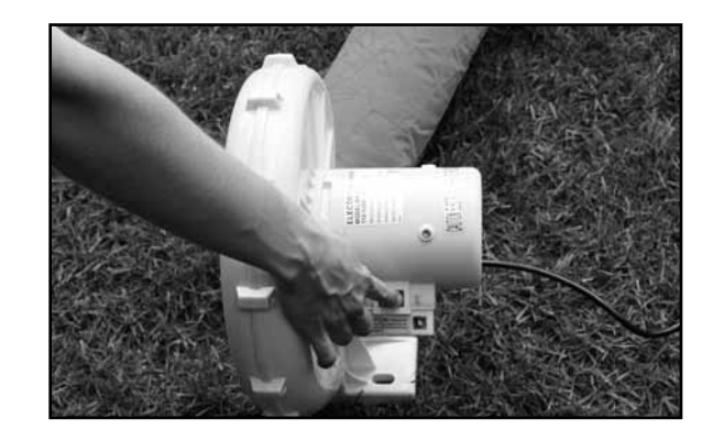
Plug in and start the blower; your unit will inflate within a couple minutes. You must leave the blower running the entire time the inflatable is being used. You will hear air "breathing" out of seams and fabric. This is intentional to allow air to escape.

Once inflated, anchor the inflatable product to the ground using the stakes provided. Never use the inflatable without anchoring it to the ground. Most inflatable injuries are caused by wind gusts. Never use your inflatable in situations where wind may affect play.