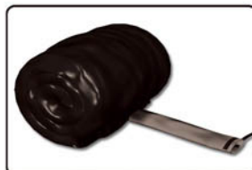
Step 4: Roll the game into a roll by starting at the front and working back towards the inflation tube.