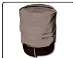
Step 6: Place the game into a Game Bag or Game Wrap.