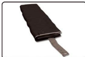
Step 3: Fold in the other side.