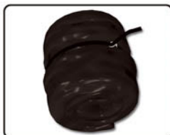
Step 5: Use a game strap to secure the roll.