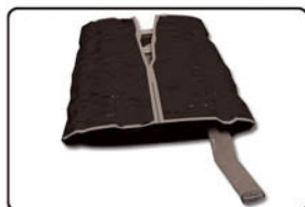
Step 2: Fold the game in 3rd's by folding one side in.