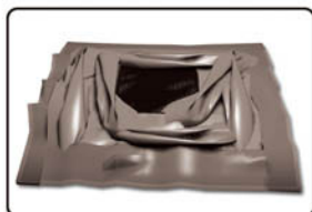
Step 1: Lay the game out flat. Seam all edges.